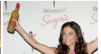
Bethenny Frankel's Skinnygirl drinks yanked from Whole Foods