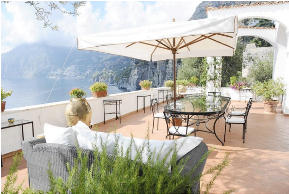
The terrace of the main house of Villa Lilly in Praiano on Italy's Amalfi Coast. (July 19, 2011)