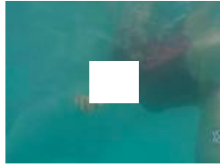
Where to Snorkel in Bermuda