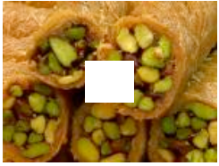
Top 5 Moments in Syria