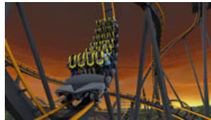
Six Flags America to launch 'Apocalypse' in 2012