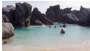
Bermuda by boat: an itinerary for 48 hours in port